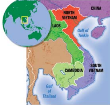
In 1976 North Vietnam and South Vietnam were reunited into one country, the Socialist Republic of Vietnam