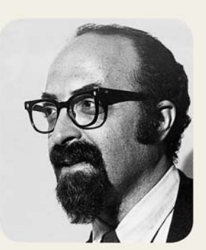
Chaim Potok 1929–2002

While growing up in New York City, Chaim Potok lived the strict life of a Hasidic Jew. His parents wanted him to be a religious scholar. But by the time he was 16, Potok had started reading